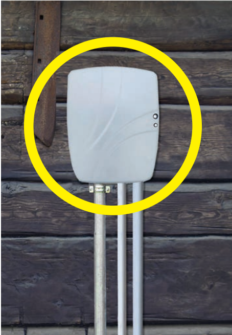
A clamshell must be hung on every home or business to get service.

the point to which the fiber-optic cable will be buried. The technician will also talk with you about any underground things on your property to avoid. At the second appointment towards the end of the months-long project, Golden West will connect your high-speed internet service.