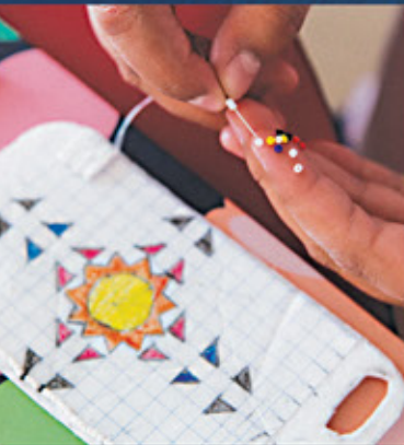
Traditional Lakota arts and crafts are part of the school's curriculum.

If you would like more information on the Pine Ridge Girls' School or would like to donate and help them empower the next generation of Lakota women, visit www.pineridgegirlsschool.com .