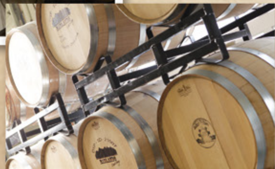
Barrels aging a special batch of bourbon.