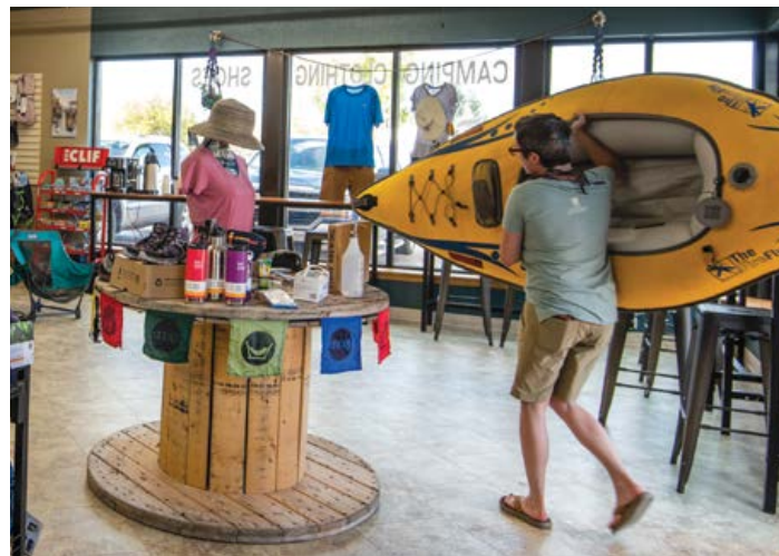
Kayaks and paddleboards let you take advantage of area lakes.