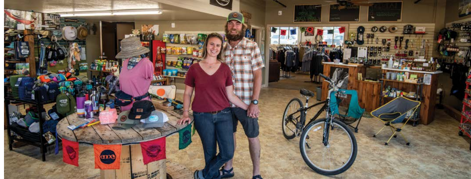
The shop specializes in fill-in gear – everything you need for outdoor adventure.