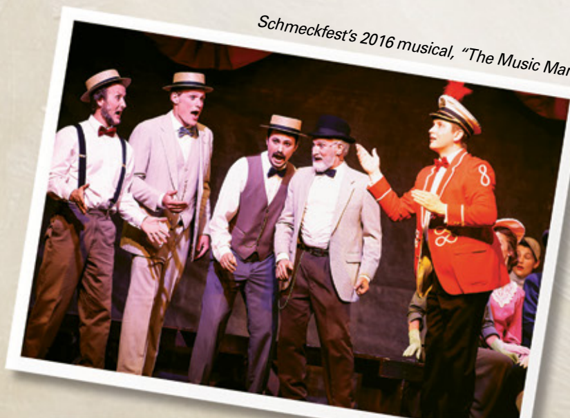
Schmeckfest's 2016 musical, "The Music Man"