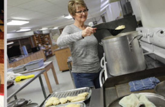
A Community Favorite, Cheese Pockets