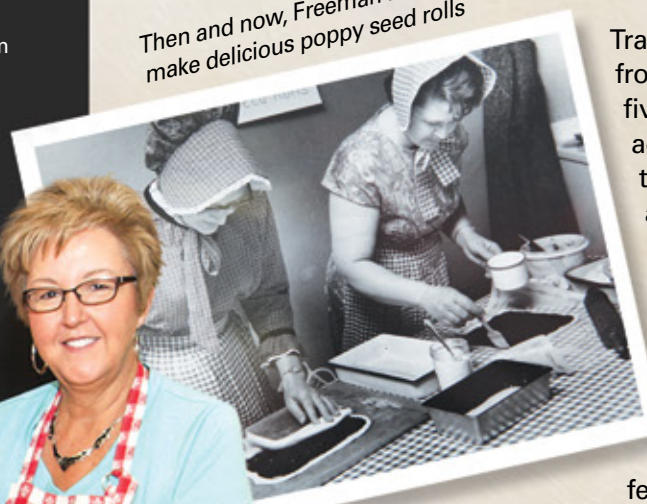
Then and now, Freeman ladies make delicious poppy seed rolls