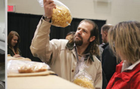
Buying Homemade Noodles