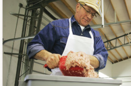
Making the Famous Sausage