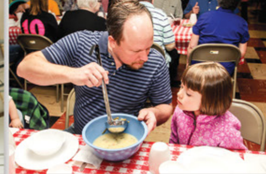
Family Style Servings