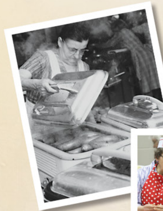
Freeman ladies, checking sausage and making cheese buttons

"In the 18th century, Katherine the Great recruited German people to farm Russian land by promising them their own schools and churches, and no military service. As the Russian's view of this arrangement began to change, the Germans looked for a new home. In the 1870's the Homestead Act was passed and they saw this opportunity and many of them headed for America. A small percentage of these Germans from Russia were Mennonites, and three of these Mennonite groups, the Low Germans, Hutterish, and Swiss settled in the Freeman area. The only place in the world where these three groups lived together."