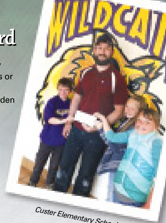
Custer Elementary Schools

It's heart-warming to see all the different ideas and causes supported by the elementary school students in our exchange. With your help, 2018's Pay it Forward campaign can inspire even more giving and brilliance from these great kids.