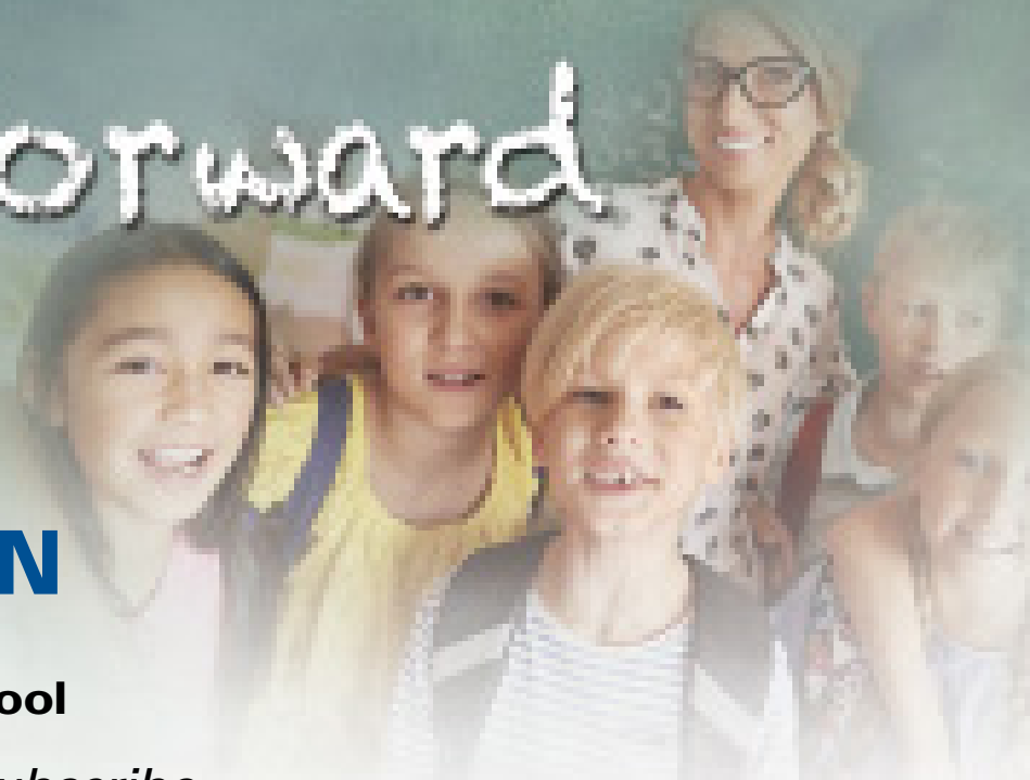
Mission Elementary Schools

The upgraded or new service promotion is for residential and business customers and must be maintained for six months. If you should discontinue this service it will result in $50 and the installation costs being billed back to your account. Golden West Internet speeds may vary based on network infrastructure and service availability. SmartPAKs may not be available in all areas and businesses do not qualify for bundles. Leased modems, receivers and remotes remain the property of Golden West and must be returned if the service is canceled. Monthly costs do not include local, state or federal charges or end-user fees. Golden West is an equal opportunity provider and employer.