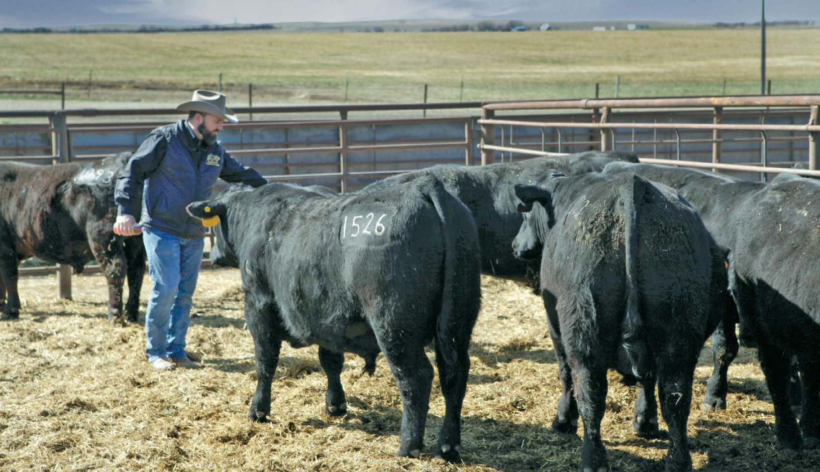
In addition to the bull sale, JLC relies on fiber optic technology from Golden West for optimum feeding and farming operations.