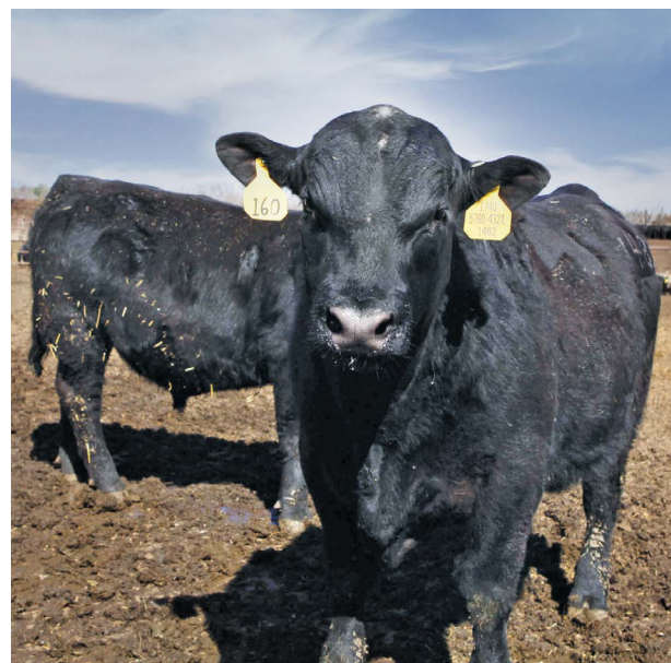
Jorgensen Land & Cattle tends to a herd of about 5,000 Angus cattle.